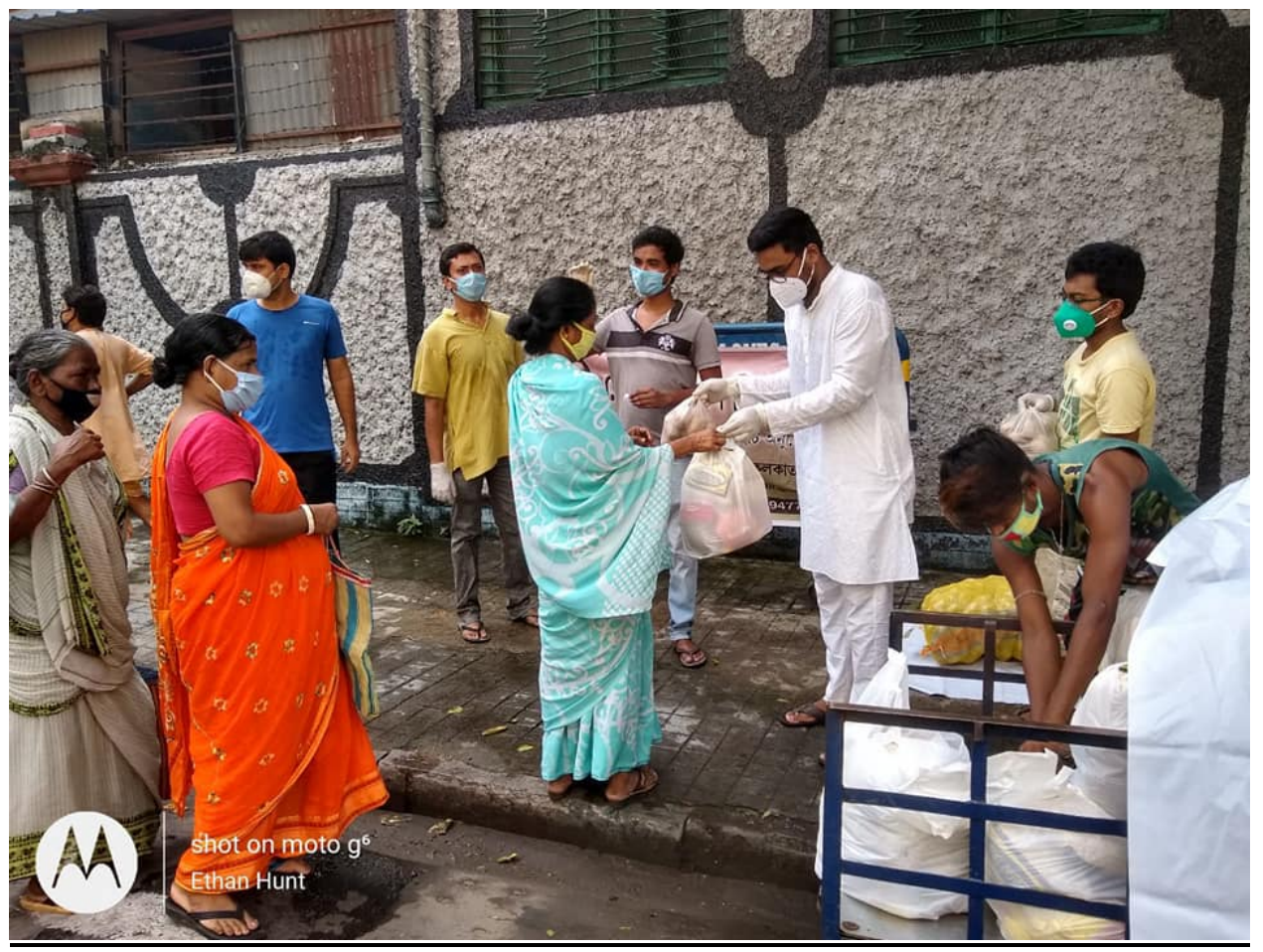
GOABAGAN SLUM AREA, NORTH KOLKATA, WEST BENGAL

Registration No. S/86180 of 1996-97 under the West Bengal Societies Registration Act, 1961