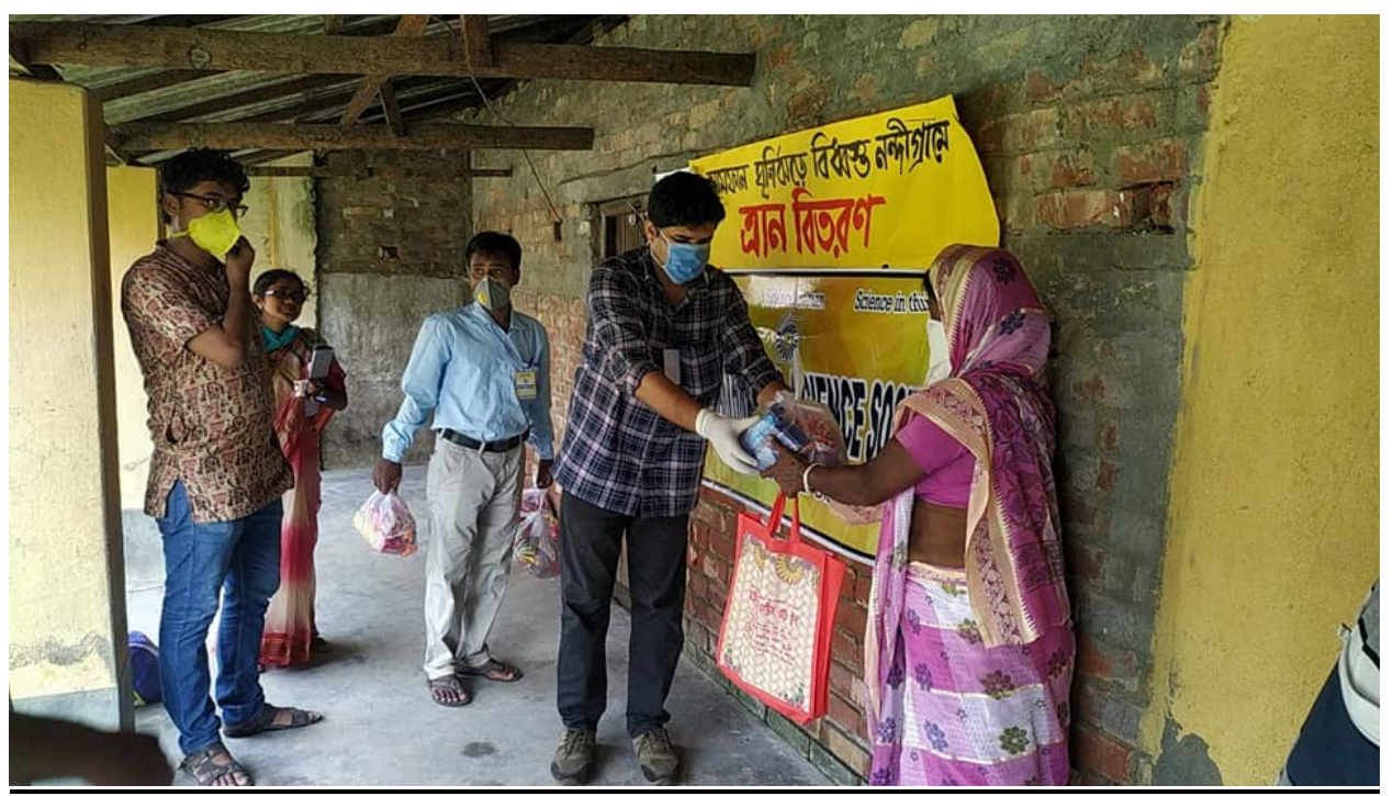
NANDIGRAM (EAST MIDNAPORE, WEST BENGAL)

A Voluntary Organization Committed to the Cause of Science, Culture and Scientific Outlook