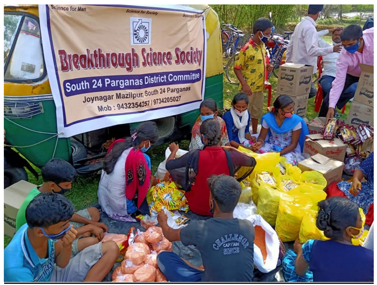
KULTALI, BHUBANESHWARI BLOCK (SOUTH 24 PARGANAS, WEST BENGAL)

Registration No. S/86180 of 1996-97 under the West Bengal Societies Registration Act, 1961