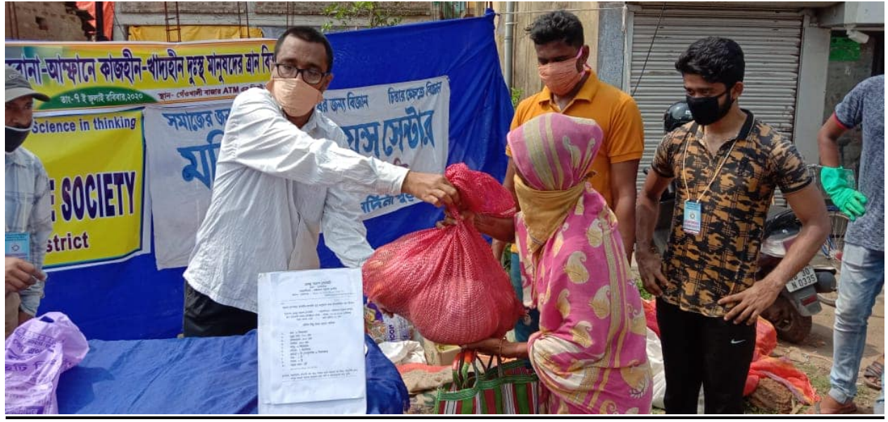
MAHISADAL (EAST MIDNAPORE, WEST BENGAL)