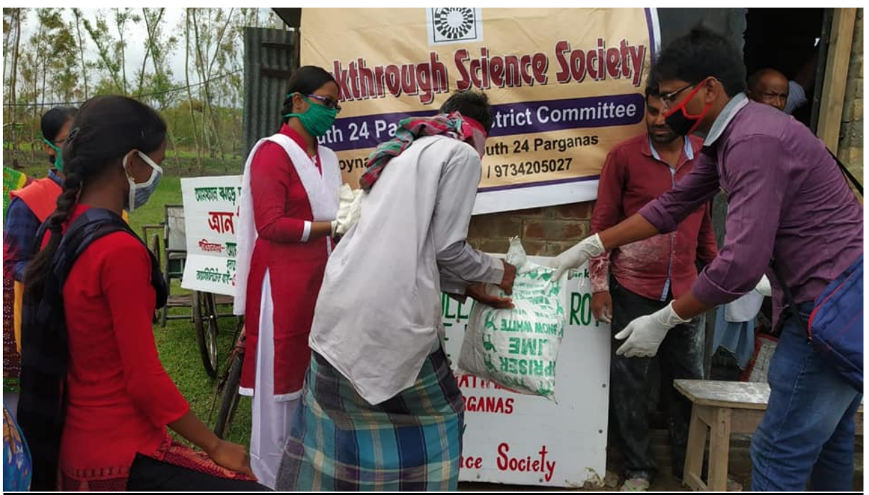
PATHAR PRATIMA, BLOCK 2 (SOUTH 24 PARGANAS, WEST BENGAL)

Registration No. S/86180 of 1996-97 under the West Bengal Societies Registration Act, 1961