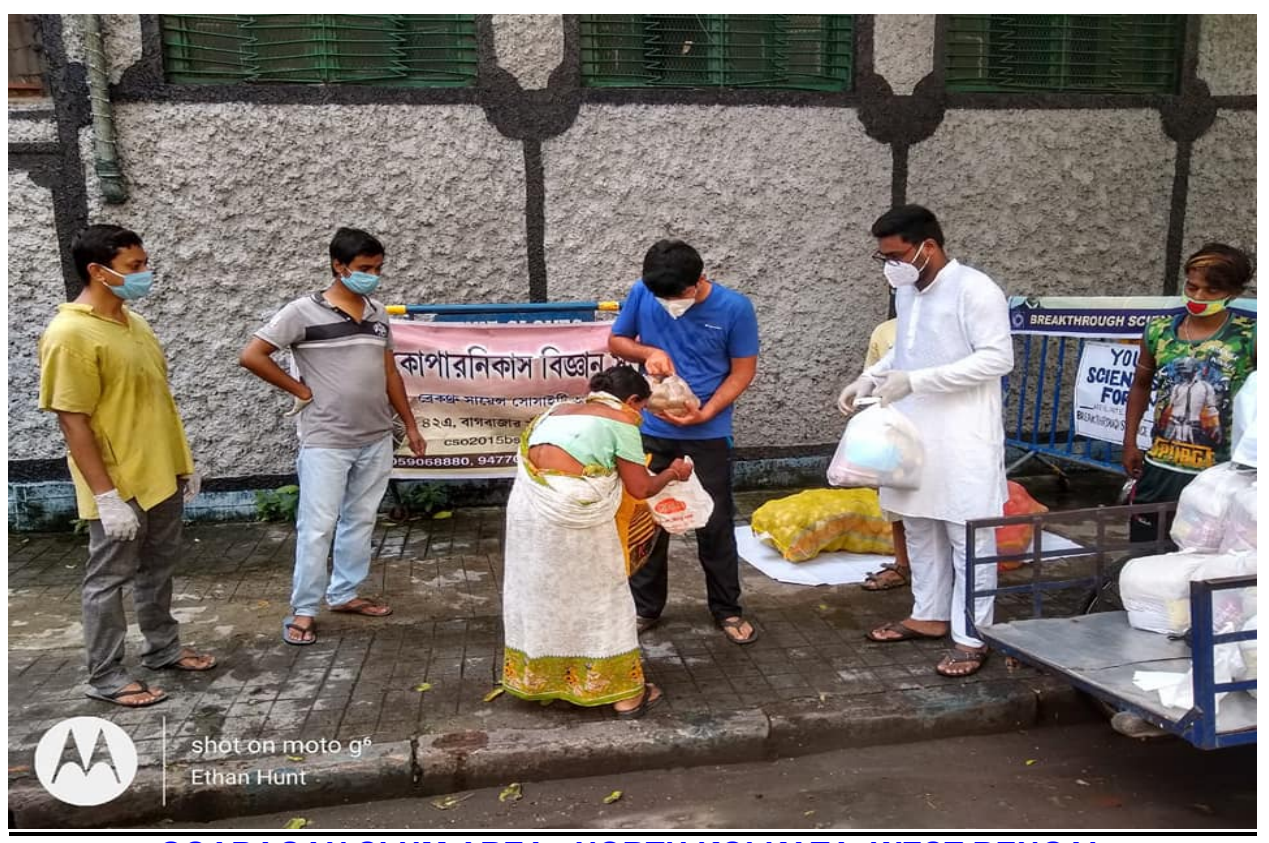
GOABAGAN SLUM AREA, NORTH KOLKATA, WEST BENGAL

Registration No. S/86180 of 1996-97 under the West Bengal Societies Registration Act, 1961