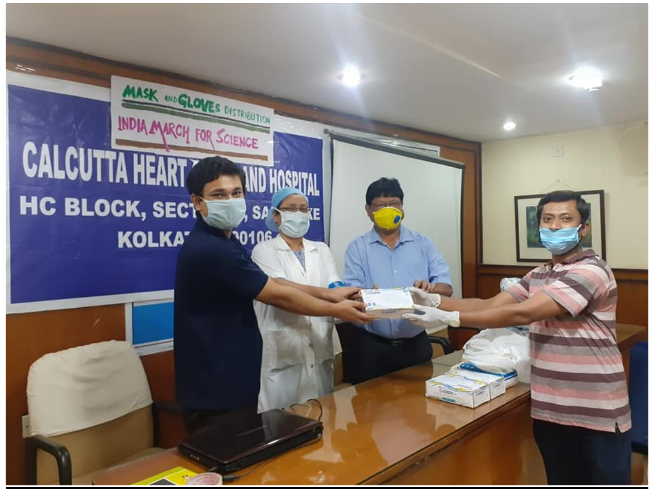
HANDING OVER OF SANITARY MASKS & GLOVES BY INDIA MARCH FOR SCIENCE, CALCUTTA HEART CLINIC HOSPITAL, KOLKATA

Registration No. S/86180 of 1996-97 under the West Bengal Societies Registration Act, 1961