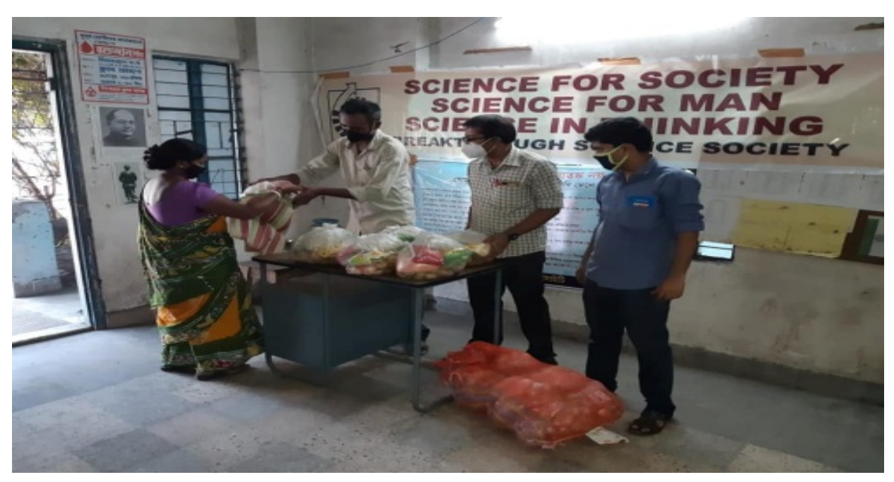
JADAVPUR (SOUTH KOLKATA, WEST BENGAL)