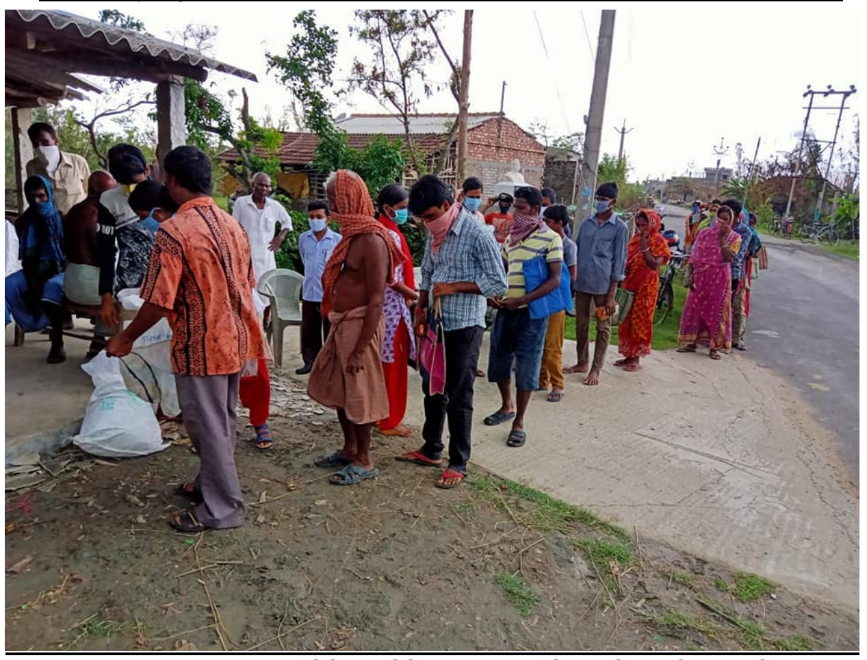
PATHAR PRATIMA, BLOCK 2 (SOUTH 24 PARGANAS, WEST BENGAL)

Registration No. S/86180 of 1996-97 under the West Bengal Societies Registration Act, 1961