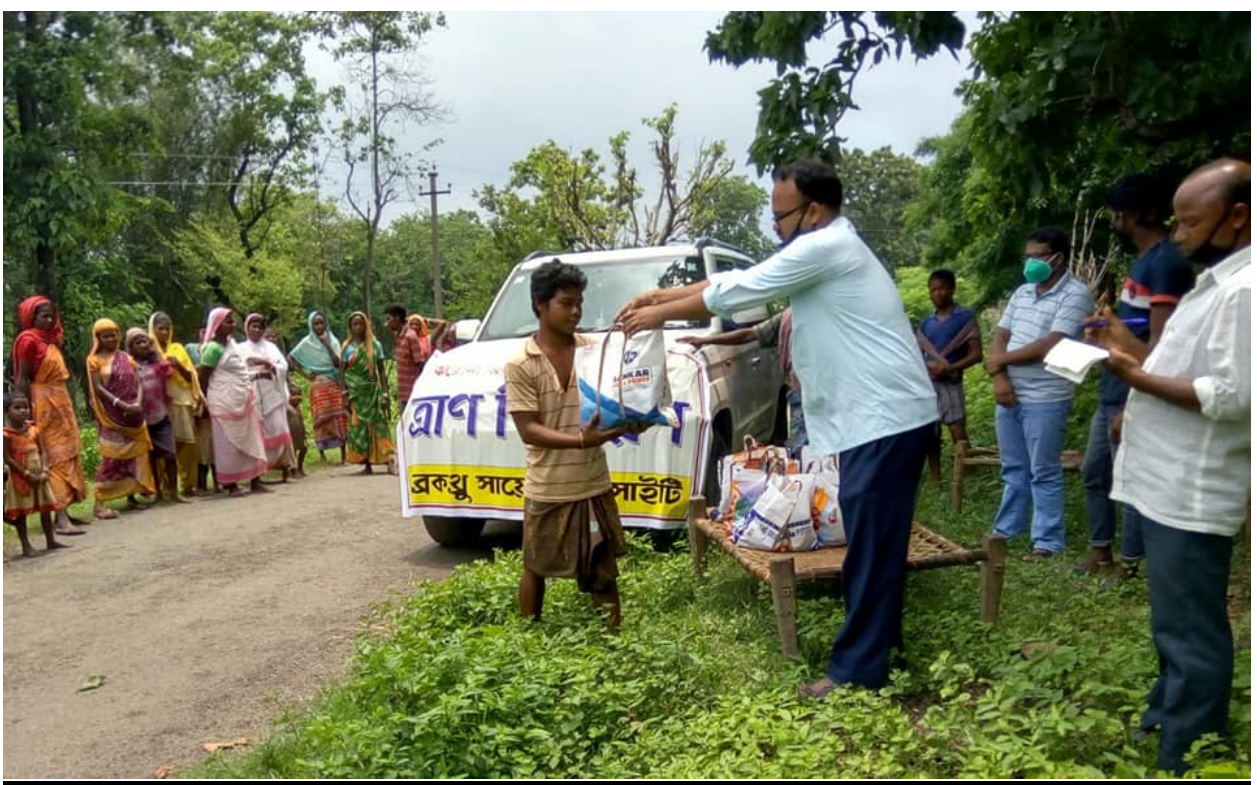
CHUNKURI VILLAGE , AYODHYA HILL (PURULIA, WEST BENGAL)

Registration No. S/86180 of 1996-97 under the West Bengal Societies Registration Act, 1961