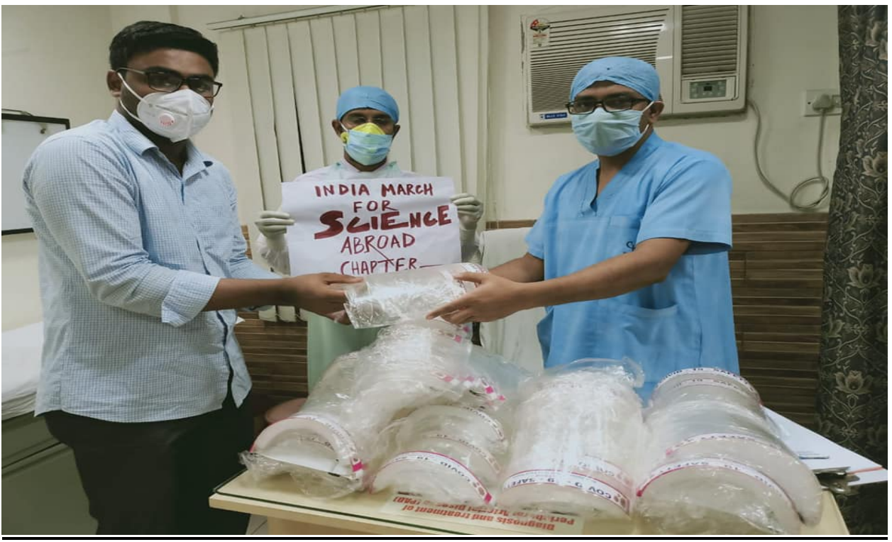
HANDING OVER OF FACE SHIELD BY INDIA MARCH FOR SCIENCE, CALCUTTA HEART CLINIC HOSPITAL, KOLKATA

Registration No. S/86180 of 1996-97 under the West Bengal Societies Registration Act, 1961