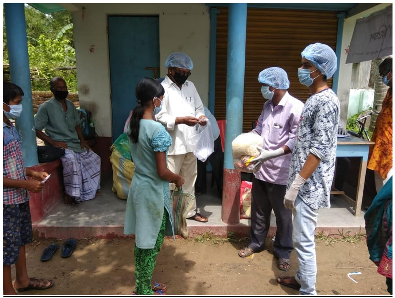
KHEJURI (EAST MIDNAPORE, WEST BENGAL)

Registration No. S/86180 of 1996-97 under the West Bengal Societies Registration Act, 1961