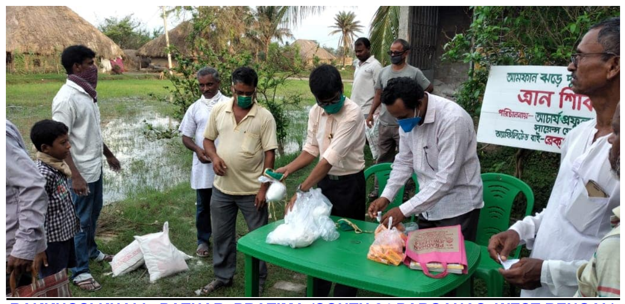
RAKKHOSI KHALI, PATHAR PRATIMA (SOUTH 24 PARGANAS, WEST BENGAL)