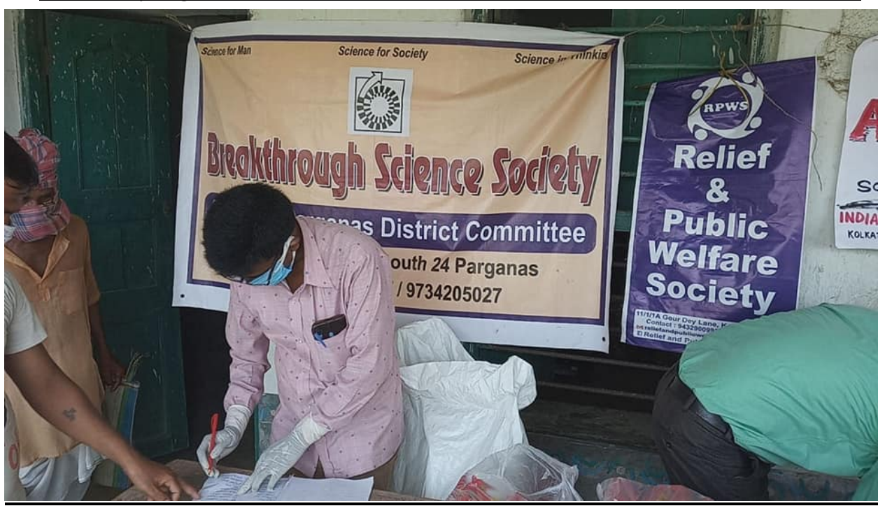
NALGARA (SOUTH 24 PARGANAS, WEST BENGAL)

Registration No. S/86180 of 1996-97 under the West Bengal Societies Registration Act, 1961