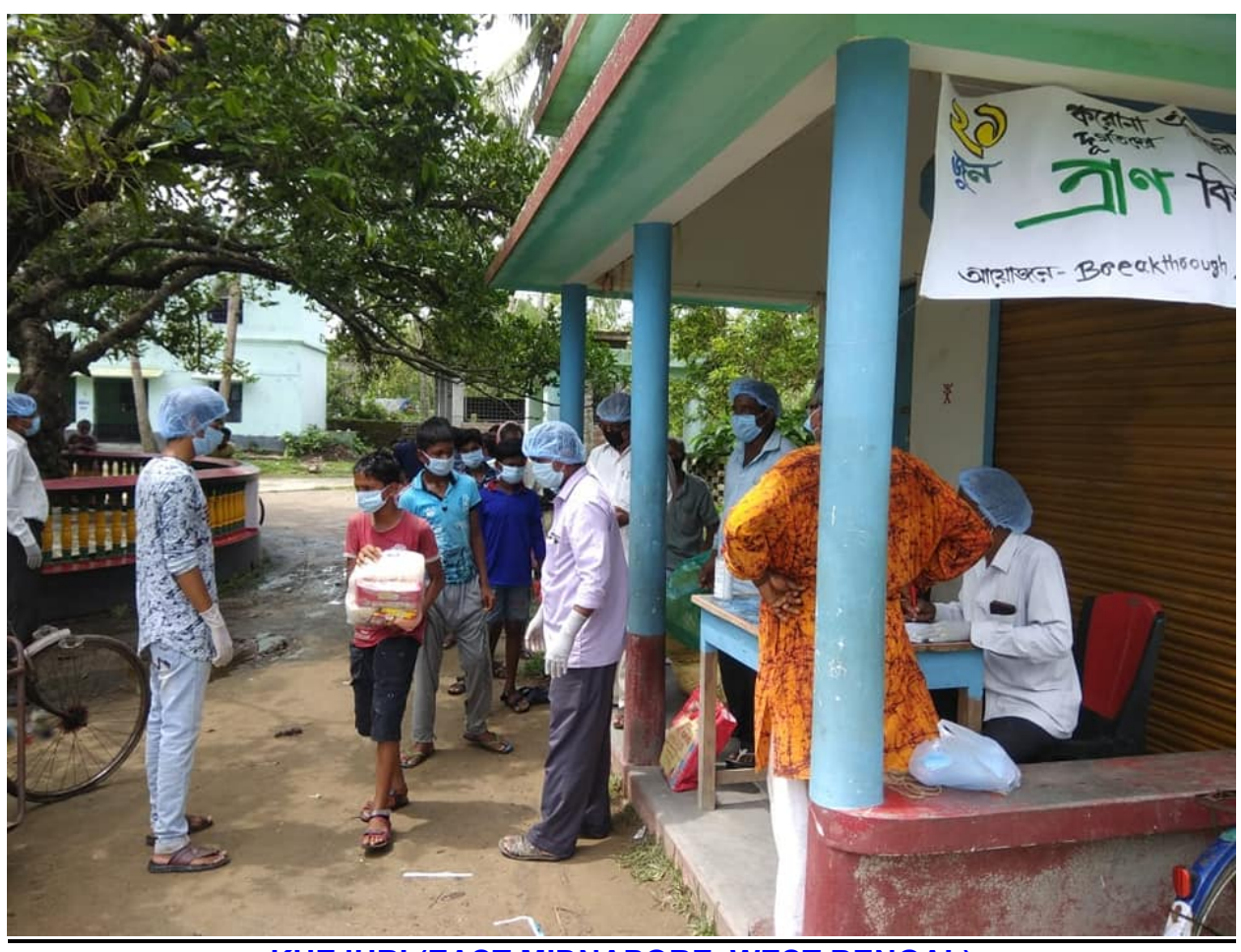
KHEJURI (EAST MIDNAPORE, WEST BENGAL)

Registration No. S/86180 of 1996-97 under the West Bengal Societies Registration Act, 1961