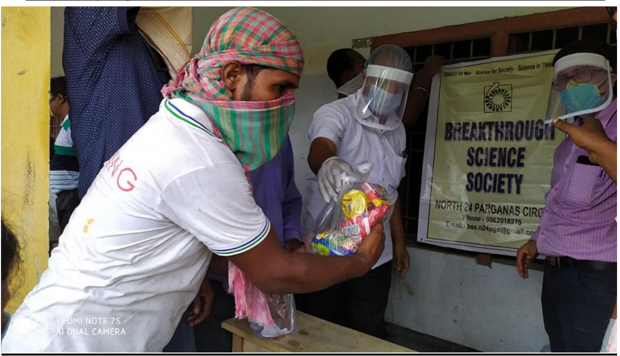
HINGALGANJ (NORTH 24 PARGANAS, WEST BENGAL)