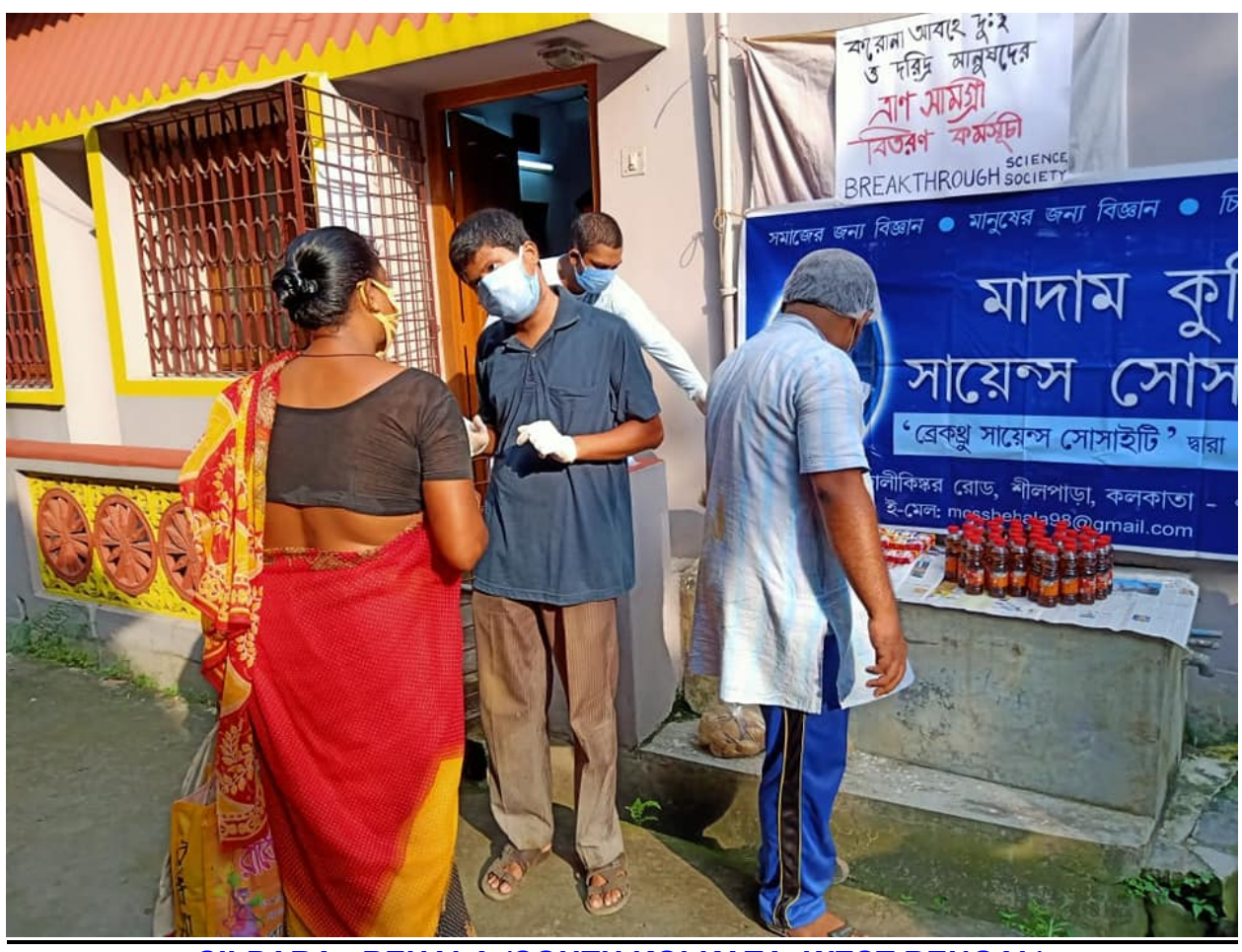
SILPARA, BEHALA (SOUTH KOLKATA, WEST BENGAL)

Registration No. S/86180 of 1996-97 under the West Bengal Societies Registration Act, 1961