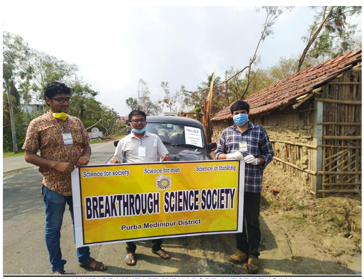
NANDIGRAM (EAST MIDNAPORE, WEST BENGAL)

Registration No. S/86180 of 1996-97 under the West Bengal Societies Registration Act, 1961