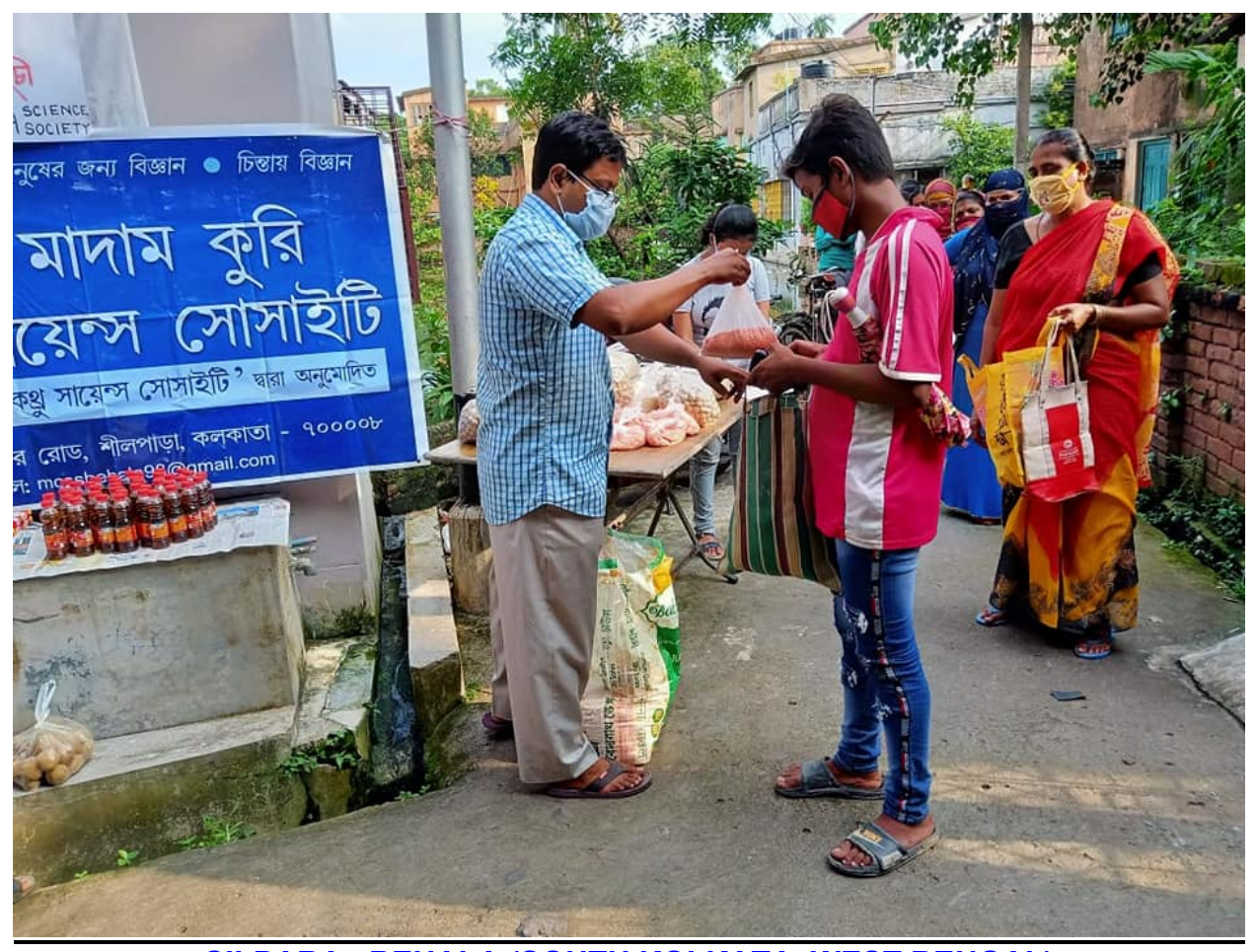
SILPARA, BEHALA (SOUTH KOLKATA, WEST BENGAL)

Registration No. S/86180 of 1996-97 under the West Bengal Societies Registration Act, 1961