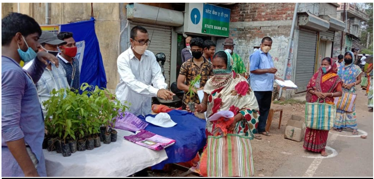
MAHISADAL (EAST MIDNAPORE, WEST BENGAL)

Registration No. S/86180 of 1996-97 under the West Bengal Societies Registration Act, 1961