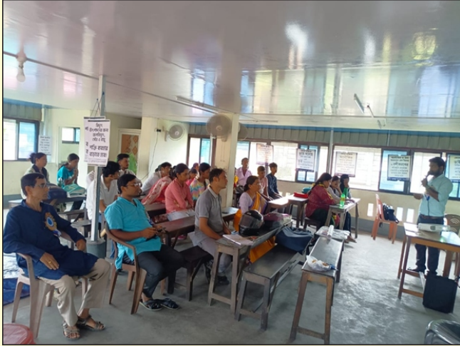
World Environment Day Programme in Howrah