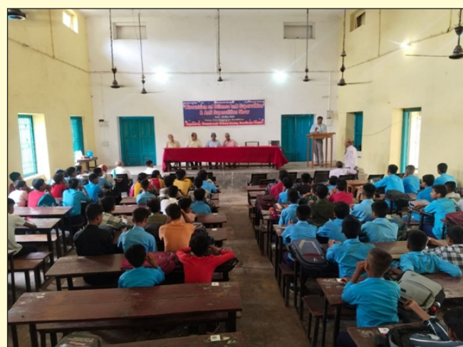
Discussion on "Science and Superstition" at D N High School

The Breakthrough Science Society Muzaffarpur Chapter organised two programmes on 29 th May, 2025 at D. N. High School in the city and at Saraiya. The topic of Discussion at D. N. School was "Science and Superstition". At Saraiya M. K. Academy, the topic was 'Climate Change'.