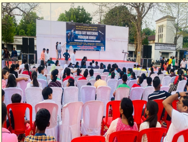
Mega Sky Watching Program