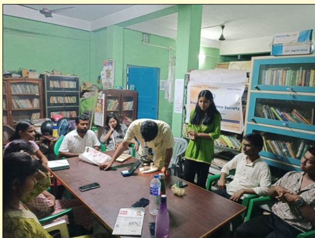
Workshop in Darjeeling