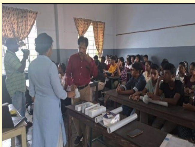
Telescope making session

The happiness and enthusiasm of the children who participated in the camp are worth mentioning. All the children requested that the camp be extended for two more days. A meeting of the parents was held in connection with the camp. Everyone expressed interest in continuing the camp activities and meeting at least once a month.