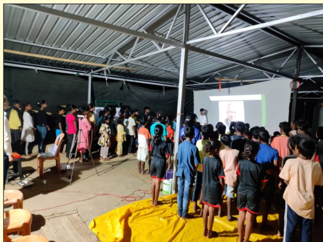
Sky watching program at Chaibasa