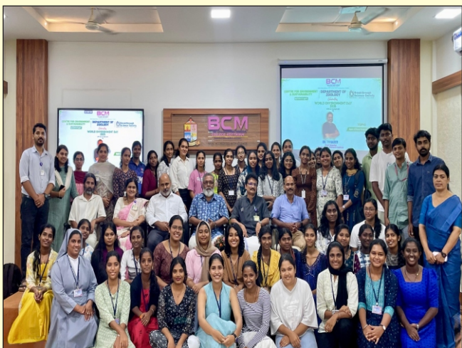
World Environment Day observed in Kottayam