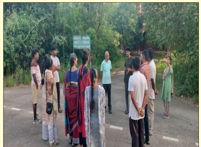
Nature walk in the campus of the Forest College, Coimbatore