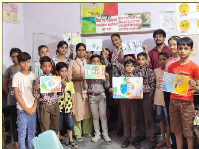
World Environment Day observed at Najafgarh

3 June: On June 3, 2025, Breakthrough Science Society, Delhi Chapter had organised a activity session with school students of Najafgarh.