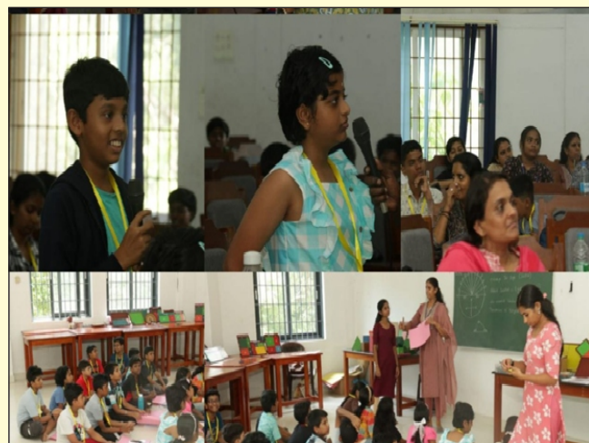
Views from the Thrissur science camp