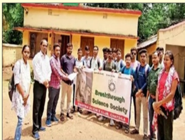
Submitting memorandum on the issue of fire catchup in the forest.