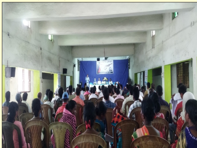
Citizens' Convention in Purulia

1 June: A citizens' convention against pollution was held at Sampriti Sadan in Sarbori More, Purulia district, at the initiative of civil society and with the support of Breakthrough Science Society. The convention was attended by a wide cross-section of people including workers, daily wage earners, teachers, professors, and doctors from the area. Over 200 people participated in the event. The convention began with an inaugural song. Following that, local citizens raised various pollution-related concerns, particularly those caused by sponge iron and cement factories.