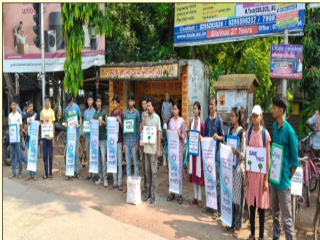
World Environment Day Programme at Bankura

3 June: A deputation was submitted to the Vice Chairperson of the Municipality in Bankura town regarding water wastage and water-related issues, along with some proposals.