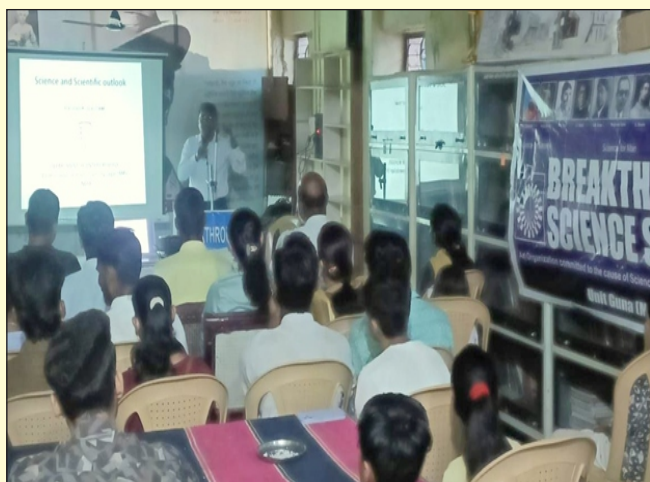
Experiments demonstration session in Guna