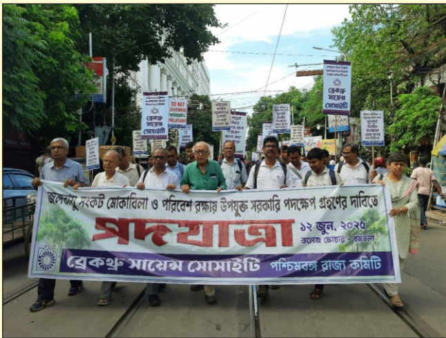
Mass Rally in Kolkata to Save the Environment

As a culmination of the "Save the Environment Week" programme, a state level mass rally was organized at Kolkata on 12 June 2025 in which about 5 hundred people including scientists, professors, teachers, scholars, students and science loving people joined to raise their voice to protect the environment. The march demanded urgent government action to combat the climate crisis and protect the environment. The science rally was started from College Square and ended at Dharmatala.