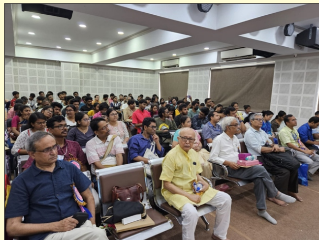
A portion of gathering of the conference