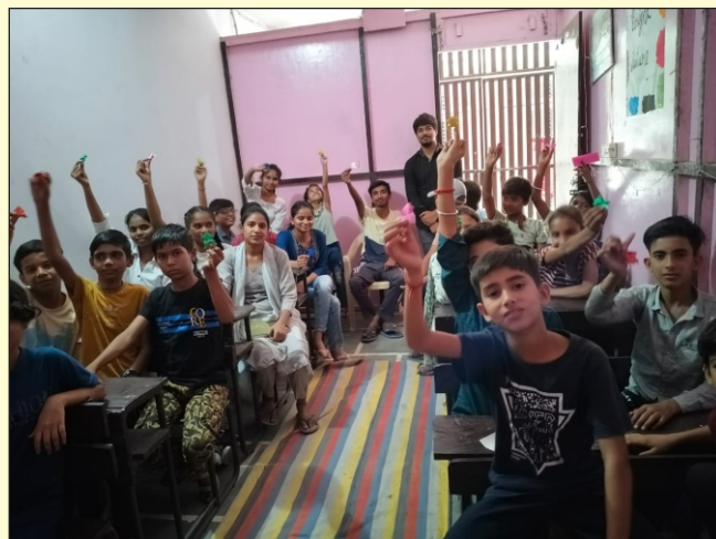
Summer camp at Burari