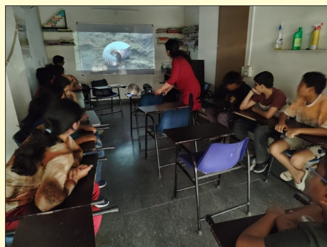
Science Documentary Show