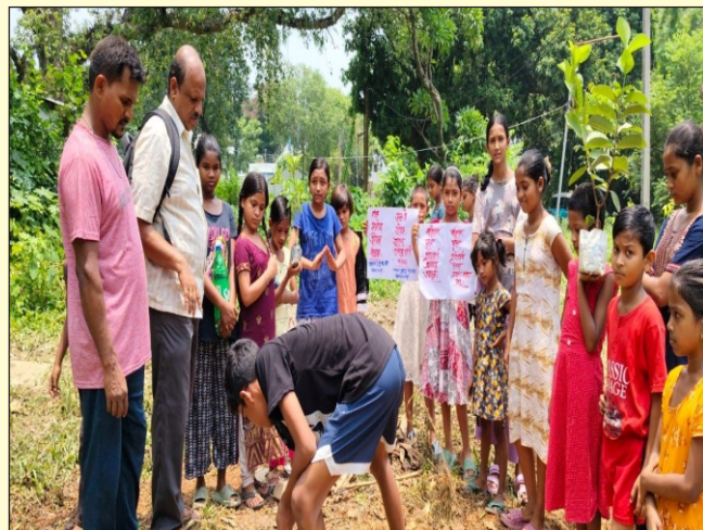
Tree Plantation Programme in Barasat