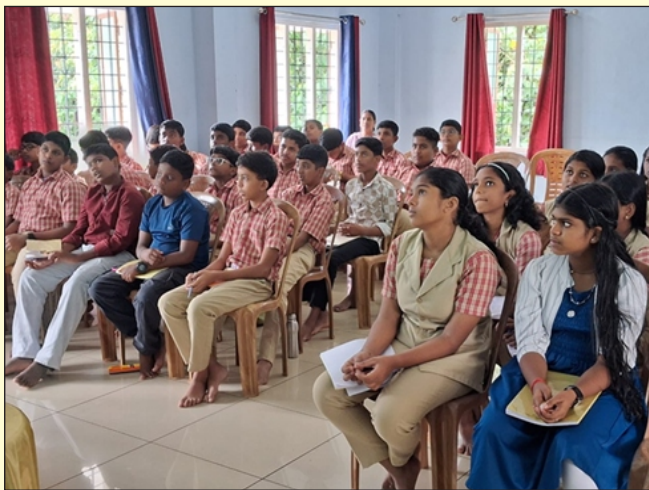
World Environment Day observed in St. Joseph HSS