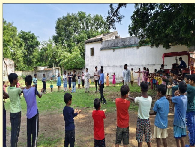
Science camp at Dampara

Galileo club, Dampara, Ghatshila organised a one-day Science Camp on 28th may,