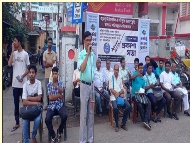
Public meeting at Contai

already built a launching pad at Junput. Since then, these two organizations, along with local fishing communities and residents, have been protesting for the cancellation of these projects.