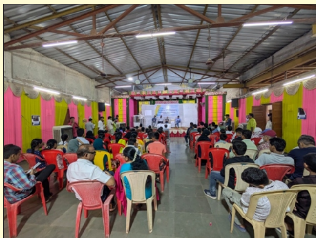
Audience of the conference

The conference began with a science exhibition by students of the Science Learning Centres (SLCs), run by BSS. The students showcased a variety of experiments they had learned and explored during the SLC sessions, demonstrating their curiosity, creativity, and growing scientific understanding.