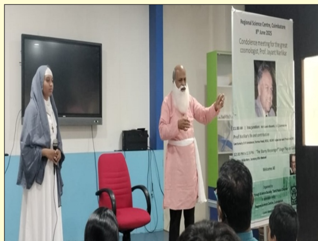
A scene from the drama on Galileo

A stage play “Starry Messenger” on Galileo's contribution was performed as a science drama where Galileo is brought back to earth by his daughter to show whether his discoveries and findings were accepted by the society. The interactive play created cheer among the audience and they also became a part of the play by interacting with Galileo.