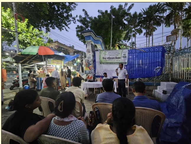
Public Meeting at Jatin Das Park Metro Station