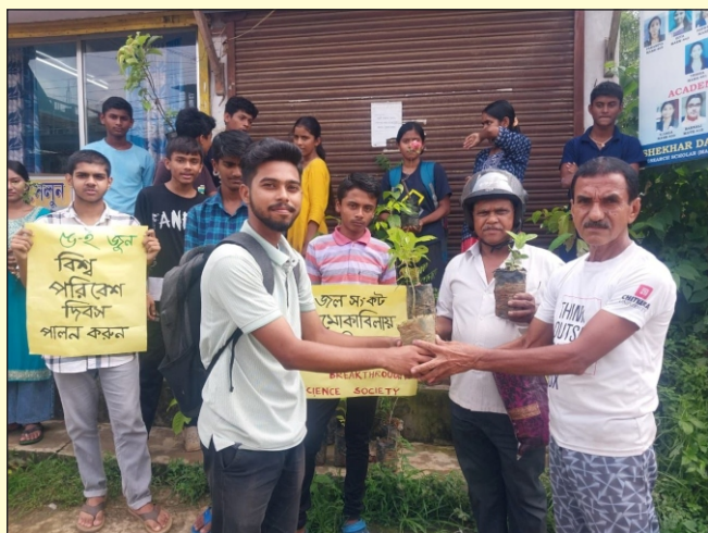
Distribute tree saplings among students