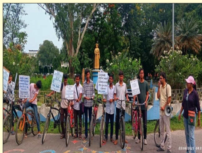
Cycle Rally at North Bengal University