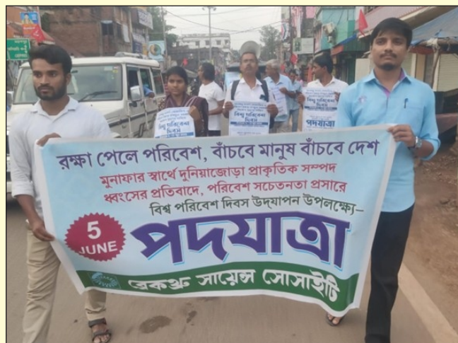
Rally in Belda Town