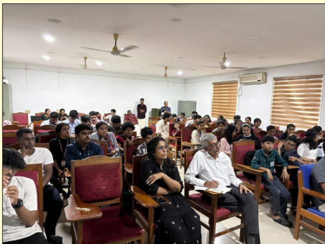
A part of the audience of the programme

local environmental issues. In the school-level presentations students from Class 5 to Plus Two stood up with quiet confidence and bold clarity, presenting topics that ranged from marine pollution caused by cargo ship accidents, flash flooding and plastic waste in Ulloor, and coastal erosion, to studies on the pollution in Killiyar River, carbon footprint awareness, sustainable ward models, stray dog overpopulation, loss of biodiversity, and more. Each presentation reflected serious thought, real-world observation, and in many cases, hands-on data collection and field study. The judging panel - Anoop S (Environmental Science Dept, Karyavattom), T.M. Vishnu Maya (NCESS), and Shaji Albert (Secretary, BSS Trivandrum Chapter) - noted that the dedication these students showed in topic selection and in preparation, was remarkable.