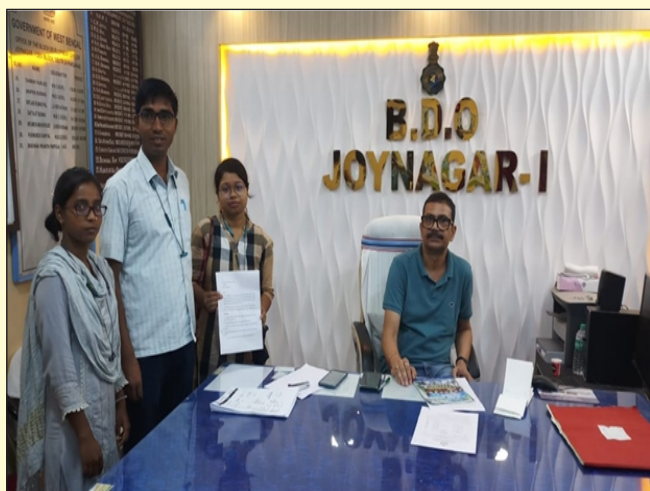
BDO Deputation Programme

17 June: A deputation was submitted at the Joynagar-1 BDO office, jointly by the South Barashat Science Unit and the Joynagar Science and Cultural Forum, demanding proper waste collection and management in panchayat areas, as well as the restoration of water bodies clogged due to continuous dumping of waste.