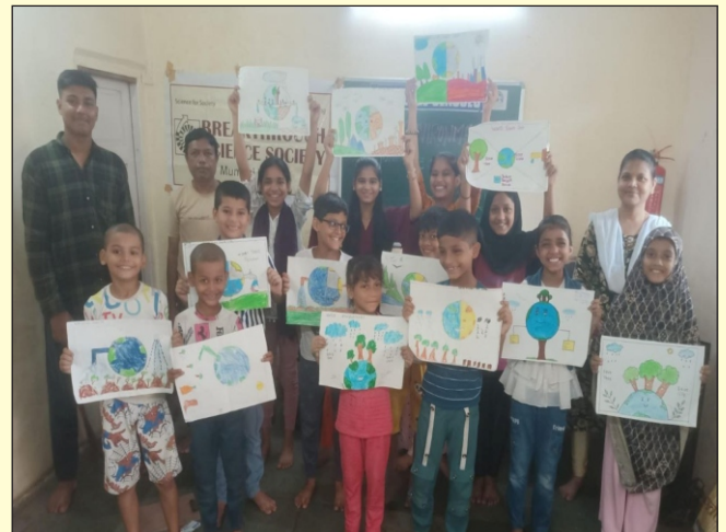
World Environment Day observed at Vikas Puri

The children participated enthusiastically and enjoyed the program.