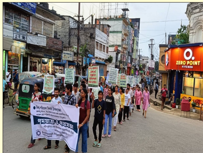
Rally at Agartala

with the distribution of plant saplings among the students and the public who attended the program from various institutions.