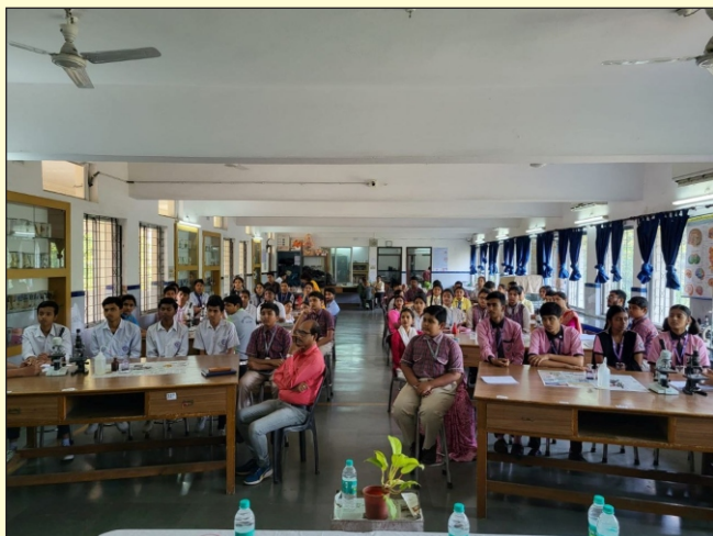
Biology workshop - Durgapur

Durgapur: A workshop on fun with Biology phase-I was successfully organised by the APC Ray Science Society Durgapur affiliated to BSS on 19th April, 2025 at the learning science centre in DAV Model School, Durgapur. 45 students from 9 different schools participated in the biology workshop.