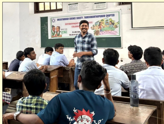
Environment Month 2025 Celebration - Trivandrum

The Breakthrough Science Society, Trivandrum chapter as part of observing the Environment Month 2025, organised a program under the banner 'Green Voices' in which school and college students were asked to make presentations on local environmental issues that needed urgent attention. A district level competition was conducted for the selected participants on June 26 at elected participants at the College of Engineering Trivandrum,