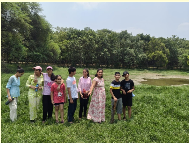
Nature Walk in the District Park at Pitampura

1. 'Nature walk' with school students at the district park in Pitampura.