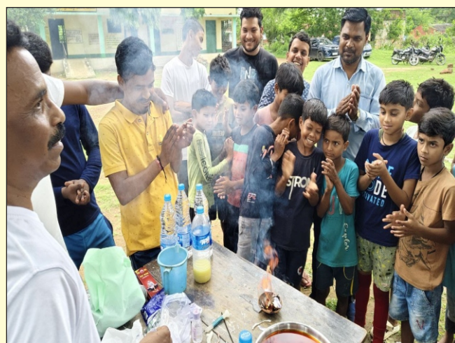
Science experiments demonstration at Peepla village