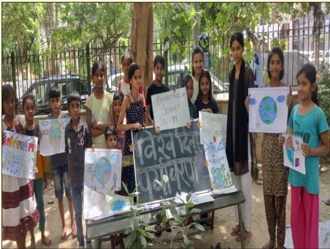
World Environment Day observed at Vikas Puri